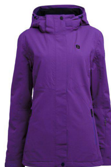
Purple - 76