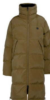
Beech - 79