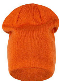
Orange Rust - A7