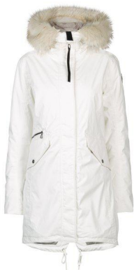
Blanc - 02