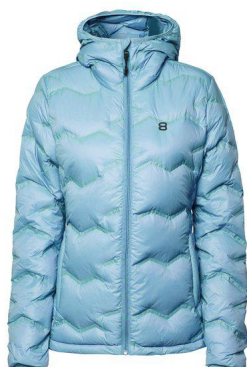
Blue Shadow - 73