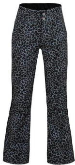
Leopard - H8