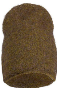
Beech - 79