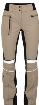
Fallen Rock - 09