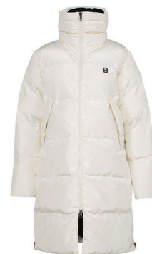
Cream - 16