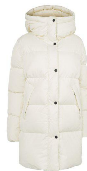
Cream - 16