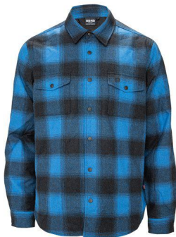
Blue - 33