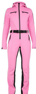
Pink - 35