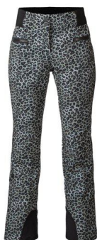
Leopard - H8