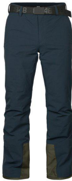
Navy - 15