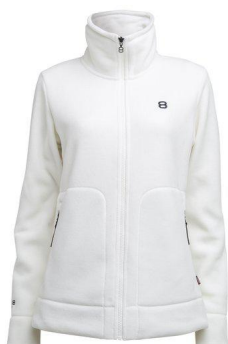
Blanc - 02