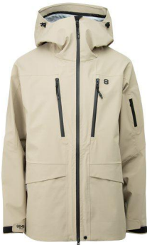
Lt Fallen Rock - 26