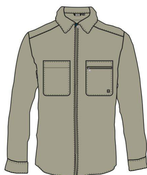
Fallen Rock - 09