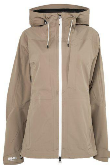
Fallen Rock - 09