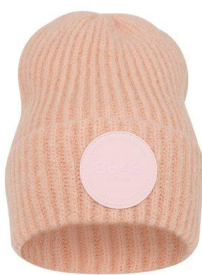
Misty Pink - B6