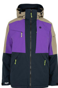
Navy - 15