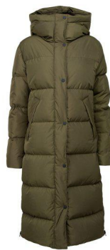
Beech - 79