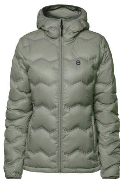
Griffin - 55