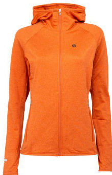
Orange Rust - A7