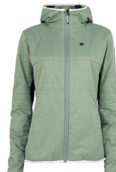
Salvia - 91