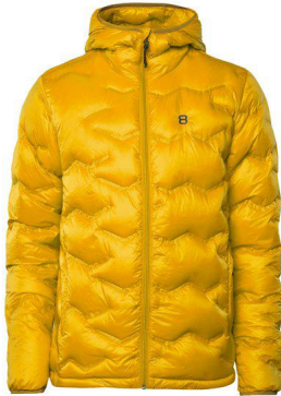
Mustard - 12