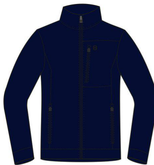
Navy - 15