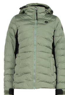
Salvia - 91