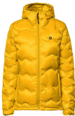
Mustard - 12