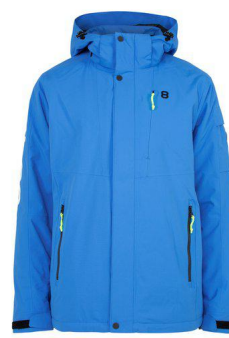
Brilliant blue - 95