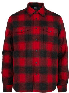
Red - 03