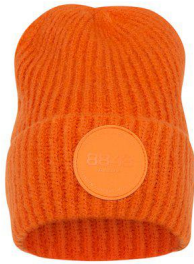
Orange Rust - A7