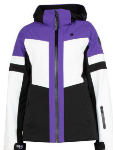
Purple - 76