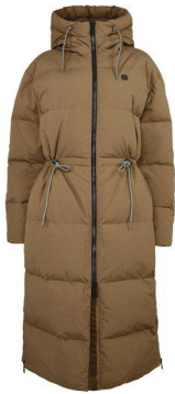
Beech - 79