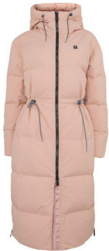
Misty Pink - B6