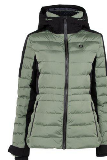
Salvia - 91