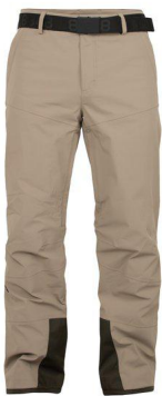
Fallen Rock - 09