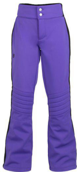
Purple - 76