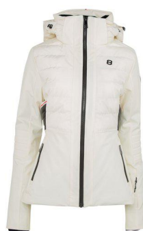
Cream - 16