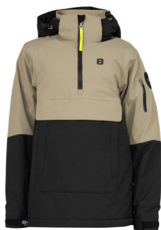
Fallen Rock - 09