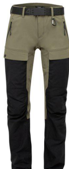
Turtle - 39