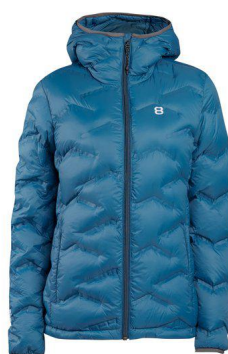
Deep Dive - A4