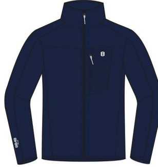
Navy - 15