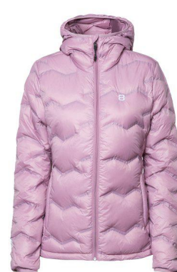
Rose - 41