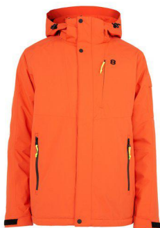
Orange Rust - A7