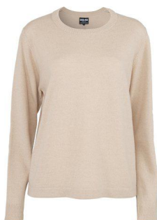
Fallen Rock - 09