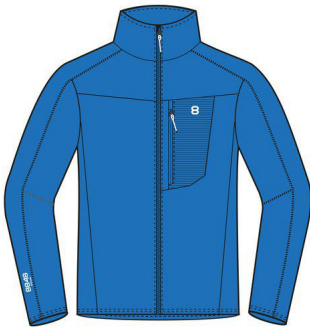
Brilliant blue - 95