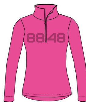
Pink - 35