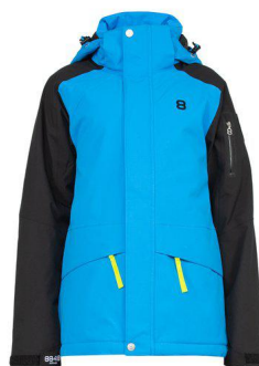
Brilliant blue - 95