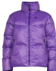
Purple - 76