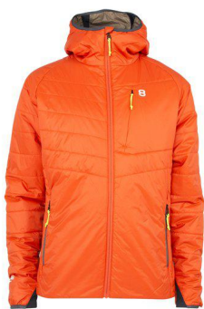
Orange Rust - A7