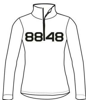
Blanc - 02