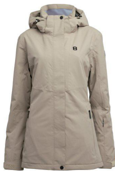
Fallen Rock - 09