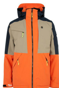
Orange Rust - A7