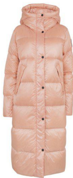
Misty Pink - B6