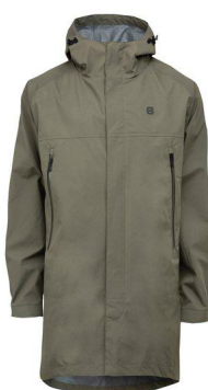
Turtle - 39