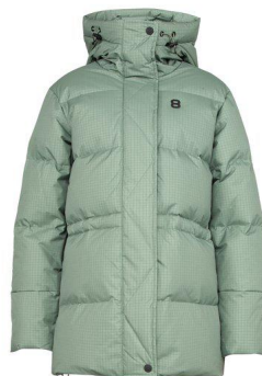
Salvia - 91