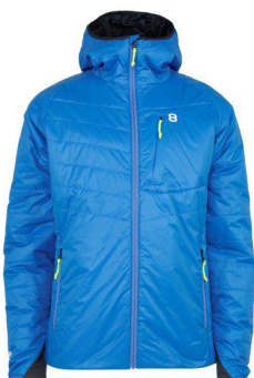
Brilliant blue - 95