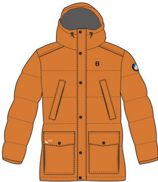
Orange Rust - A7