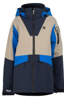
Navy - 15