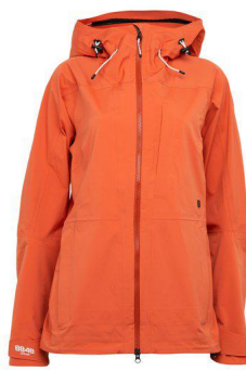
Orange Rust - A7