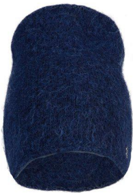
Navy - 15