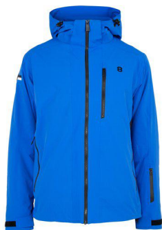
Blue/Blue - L4