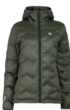
Emerald Green - 36