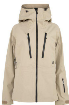
Lt Fallen Rock - 26