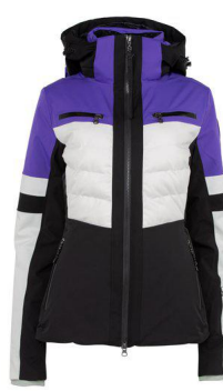
Purple - 76