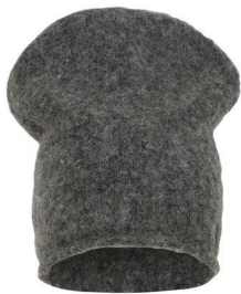
Dk Grey - 14