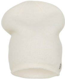
Cream - I6