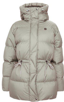
Lt Fallen Rock - 26