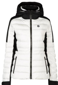
Blanc - 02