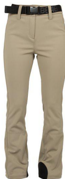
Fallen Rock - 09