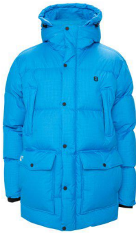
Blue - 33