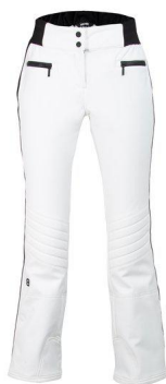
Blanc - 02