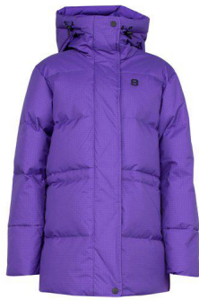
Purple - 76