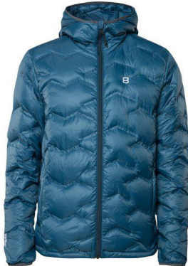
Deep Dive - A4