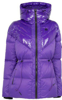
Purple - 76