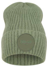
Salvia - 91