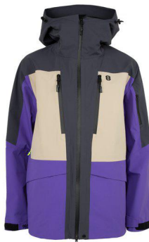
Purple - 76