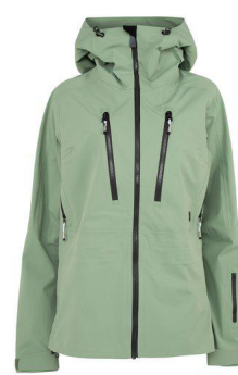
Salvia - 91