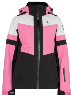
Pink - 35