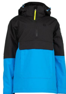
Brilliant blue - 95