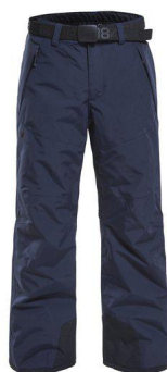
Navy - 15