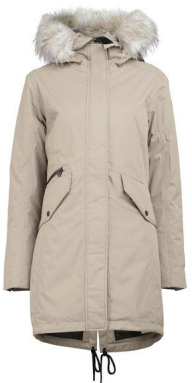
Cream - 16