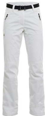
Blanc - 02