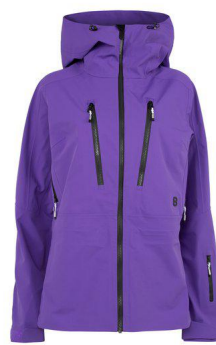
Purple - 76