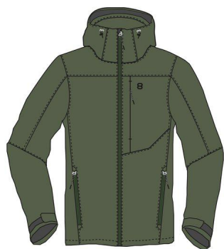
Army Green - 11