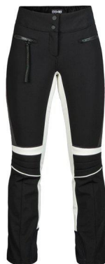
Black/Grey - K3