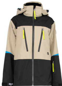
Lt Fallen Rock - 26