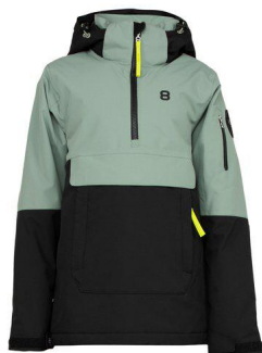
Salvia - 91