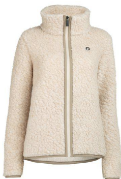
Beige - R6