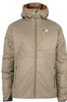
Fallen Rock - 09