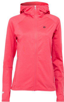
Poppy Red - 62