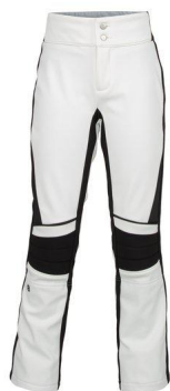
Blanc - 02