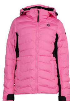
Pink - 35