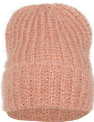
Misty Pink - B6