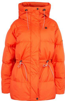
Orange Rust - A7