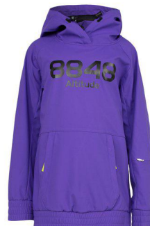
Purple - 76