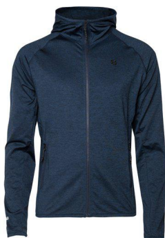
Navy - 15