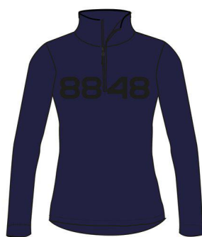
Navy - 15