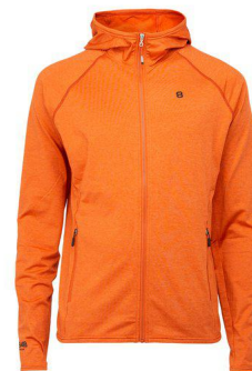
Orange Rust - A7