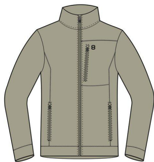
Fallen Rock - 09