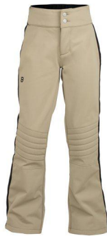
Fallen Rock - 09