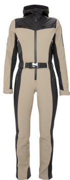
Fallen Rock - 09