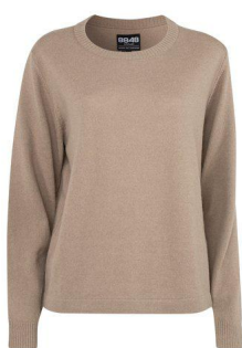
Beige - R6