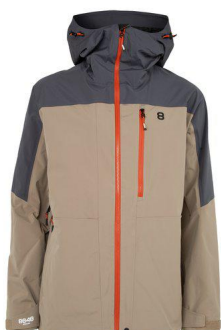
Fallen Rock - 09