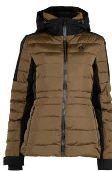
Beech - 79