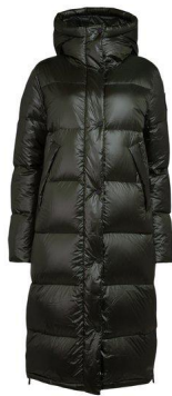
Emerald Green - 36