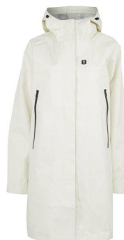
Cream - 16