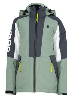
Salvia - 91