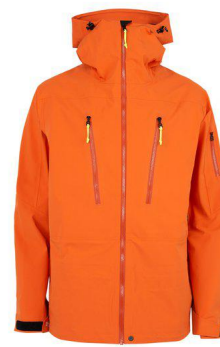
Orange Rust - A7