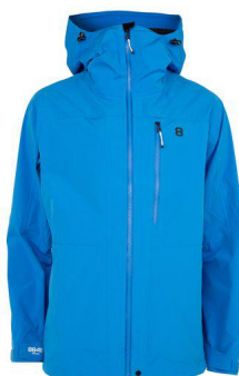
Brilliant blue - 95