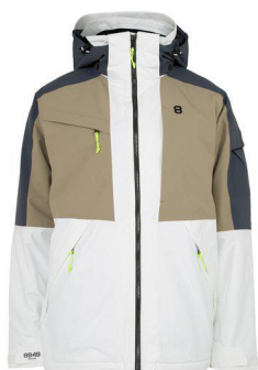
Blanc - 02