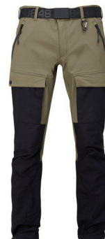
Turtle - 39