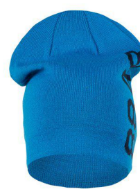
Brilliant blue - 95