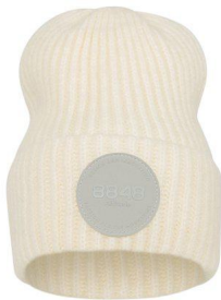
Cream - I6