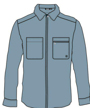
Blue - 33