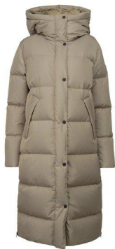
Fallen Rock - 09