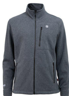
Grey melange - 78