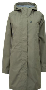
Turtle - 39