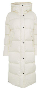
Cream - 16