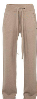
Beige - R6