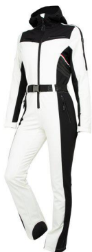
Blanc - 02