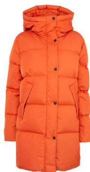
Orange Rust - A7