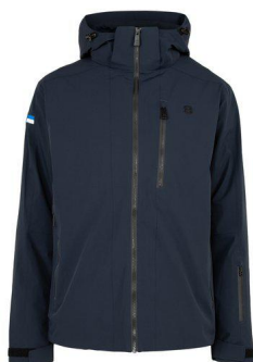
Navy/Navy - M1