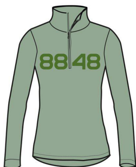
Salvia - 91