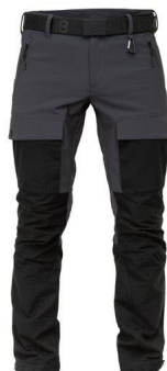
Charcoal - 18