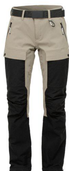
Fallen Rock - 09