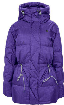
Purple - 76