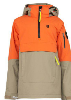
Orange Rust - A7