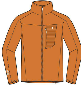
Orange Rust - A7