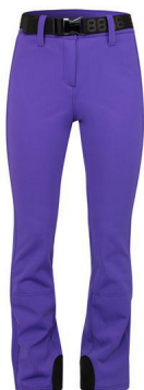
Purple - 76