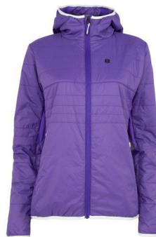
Purple - 76