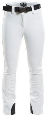
Blanc - 02