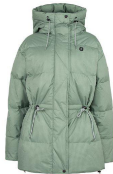
Salvia - 91