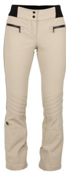
Lt Fallen Rock - 26