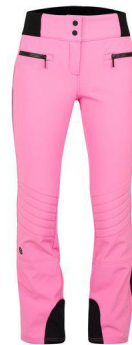
Pink - 35