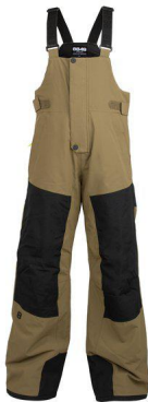
Beech - 79