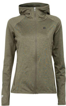
Turtle - 39