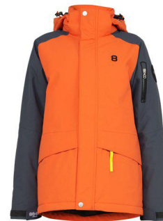
Orange Rust - A7