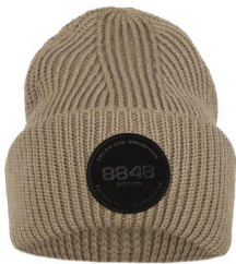
Fallen Rock - 09