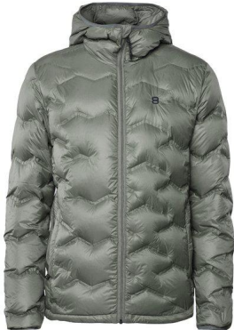
Griffin - 55