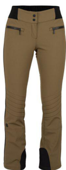
Beech - 79