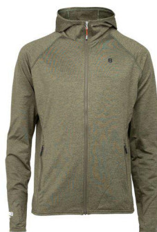
Turtle - 39