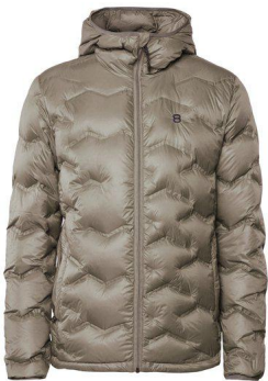
Fallen Rock - 09