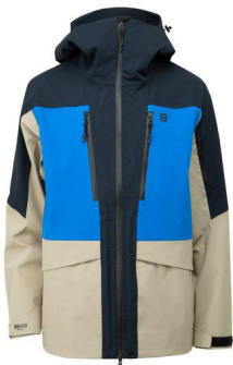
Blue - 33