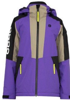
Purple - 76