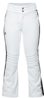
Blanc - 02