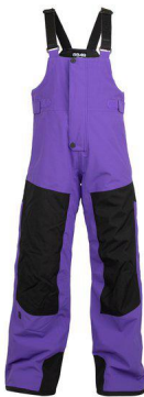
Purple - 76