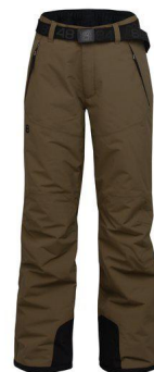
Beech - 79