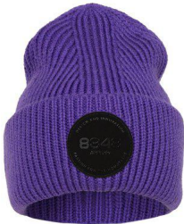
Purple - 76