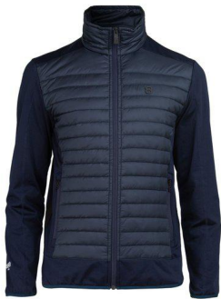
Navy - 15