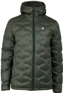
Emerald Green - 36