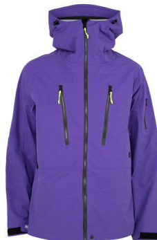
Purple - 76