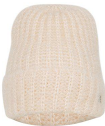
Cream - I6