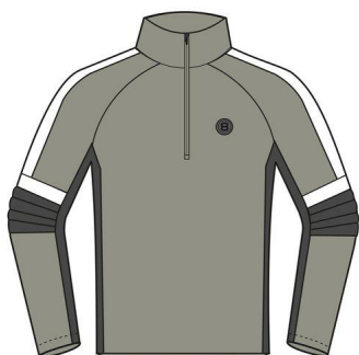
Fallen Rock - 09