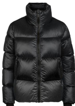
Black/Black - C1