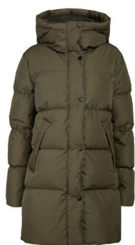
Beech - 79