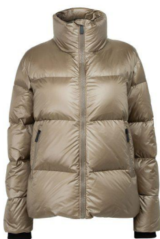
Fallen Rock - 09