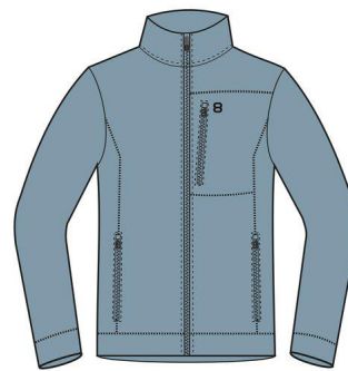
Blue - 33