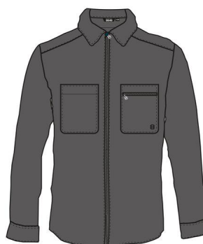
Grey melange - 78