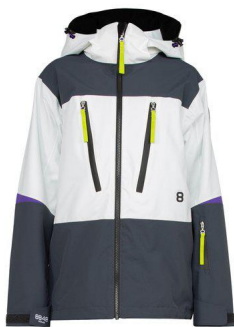
Blanc - 02