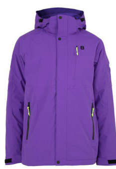
Purple - 76