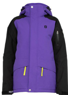
Purple - 76