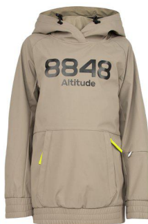
Fallen Rock - 09