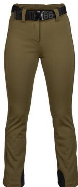
Beech - 79