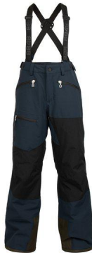
Navy - 15