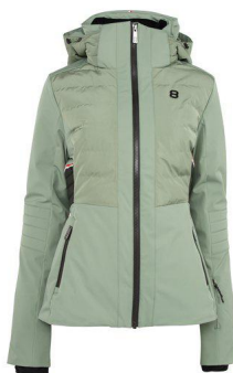
Salvia - 91