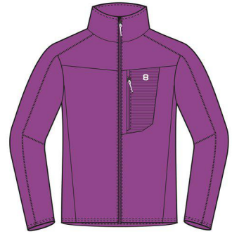
Purple - 76